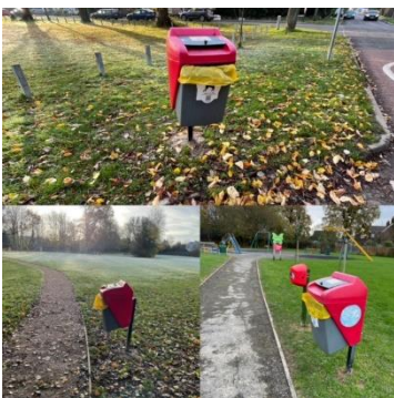
Relocated dog bins and bag dispenser

Residents have been encouraged to join HDC's 'Adopt-a-Street' campaign, and we are grateful to all those that have; because of more people around in their high-vis jackets picking up careless dropped litter items, the village is looking tidier. Dog bins have been moved nearer to paths to facilitate their use, even in wet weather, and two more dog-bag dispensers will appear shortly by bins at the Ducky.