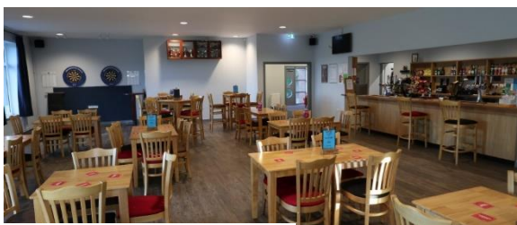
Social Club at Village Centre

The work of the Council on delivering projects has been severely curtailed due to the pandemic. However, the Council's flagship project, the complete refurbishment of the Village Centre, was completed in May 2020.