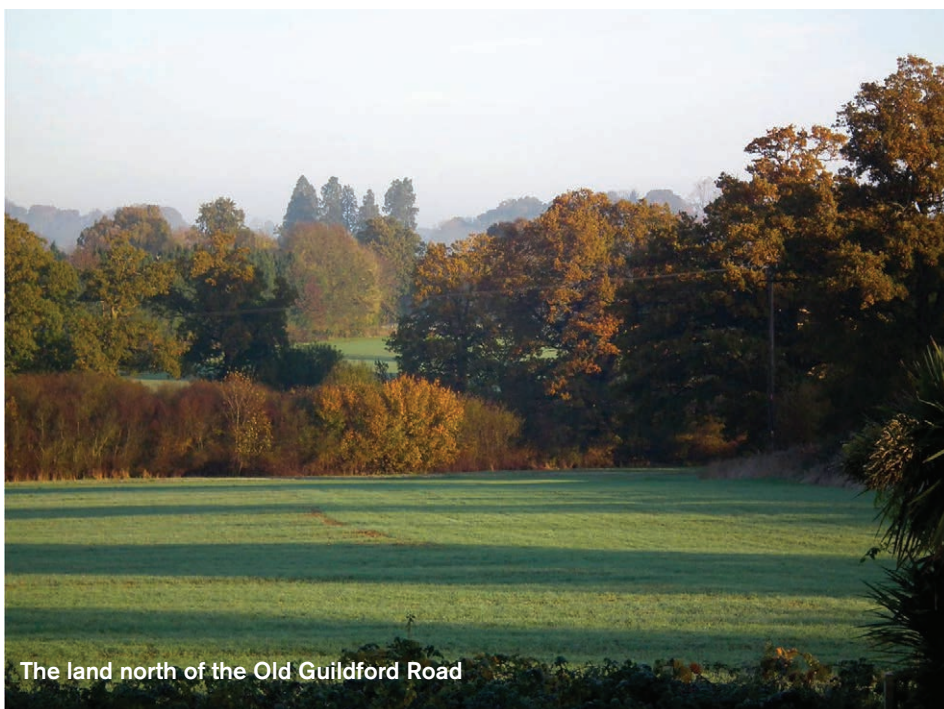
The land north of the Old Guildford Road

The Parish Council will continue to fight for the delivery of infrastructure including the much awaited traffic calming scheme for the village.