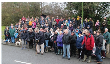
Residents protest against the development

Regretfully, after a public hearing, the Planning Inspectorate decided to allow the development to proceed. Horsham District Council cannot demonstrate a five year housing land supply whilst the Horsham Development Planning Framework has not been accepted and Gleeson Developments Ltd seized the opportunity to gain permission to build on the only developable green field site left in Broadbridge Heath.