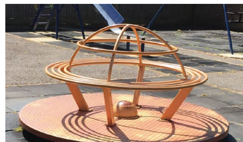
"The round thing"